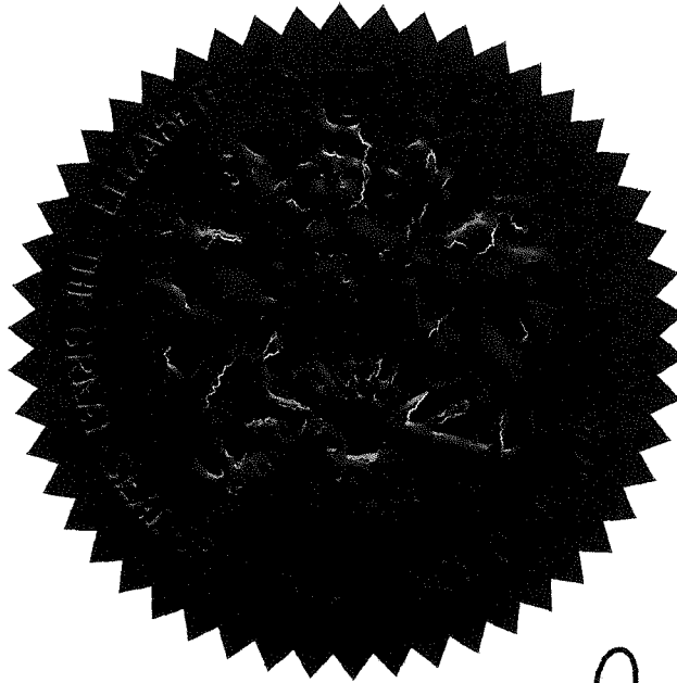
Attorney General and Minister of Justice (Counter signature for the Great Seal)